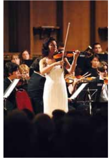
Tasmin Little performing The Lark Ascending by Ralph Vaughan Williams

All of the performers that evening were current students or alumni, who put together a spectacular programme, vividly demonstrating the enormous breadth of talent that is nurtured within the School.