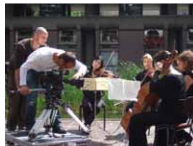
The Da Capo Quartet being filmed for The Nature of Britain

Love Letter To London , a series about unique sites in London, focuses on the Guildhall School in one episode. The Principal,